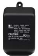
Wall Mountable Weather Resistant Housing